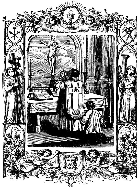
AT THE CONSECRATION.