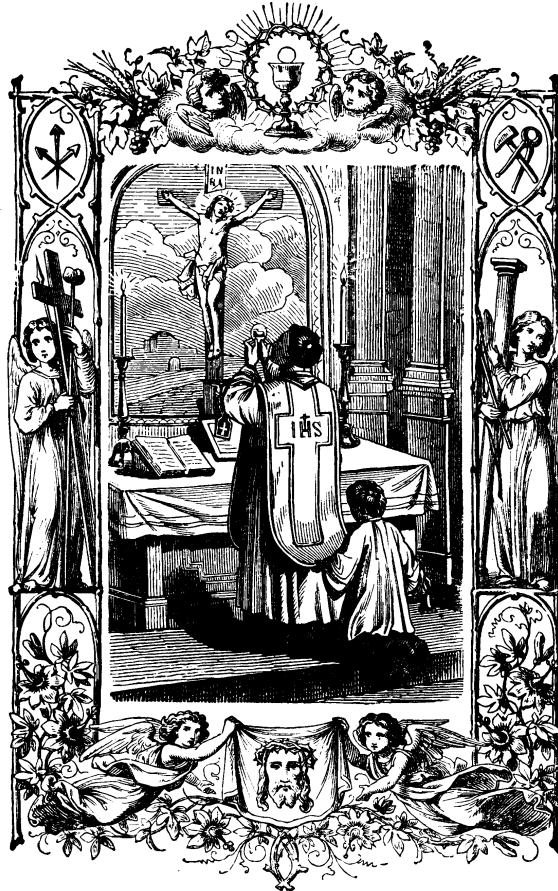
AT THE CONSECRATION.